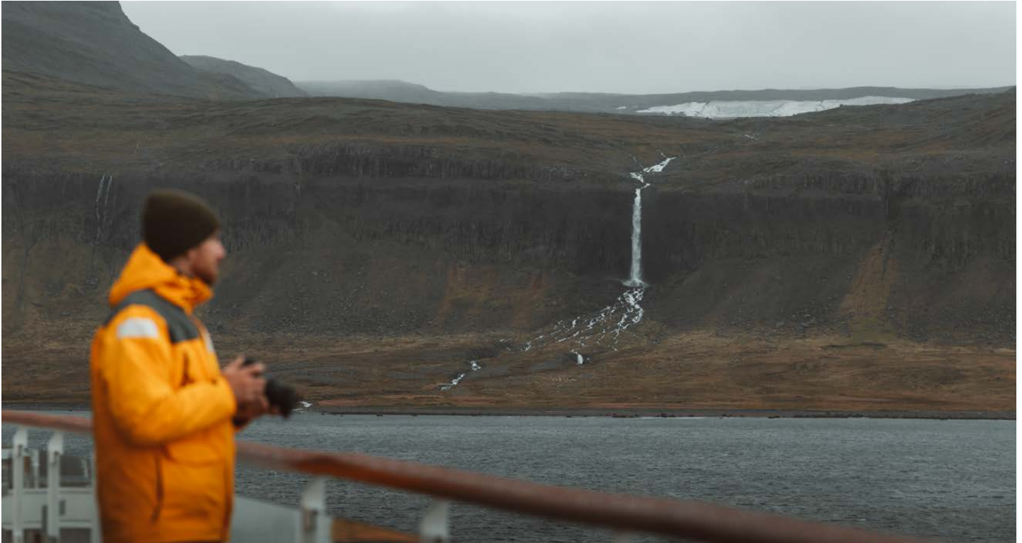
Photos captured with a telephoto lens from a responsible distance, following regulatory/AECO guidelines.