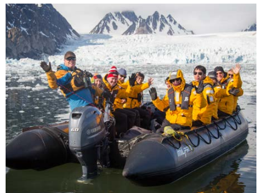
Photos captured with a telephoto lens from a responsible distance, following regulatory/AECO guidelines.