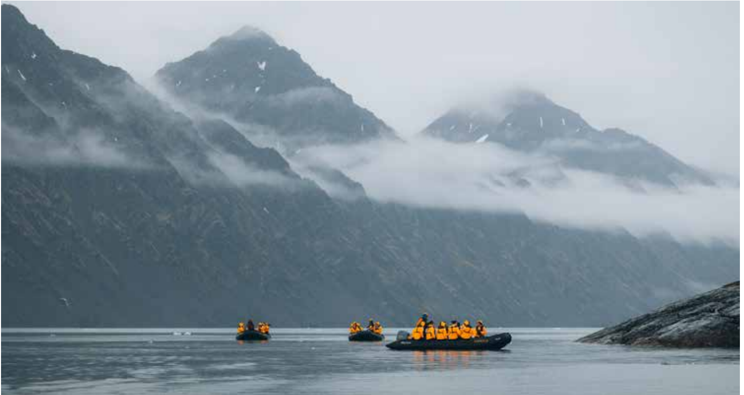
Photos captured with a telephoto lens from a responsible distance, following regulatory/AECO guidelines.