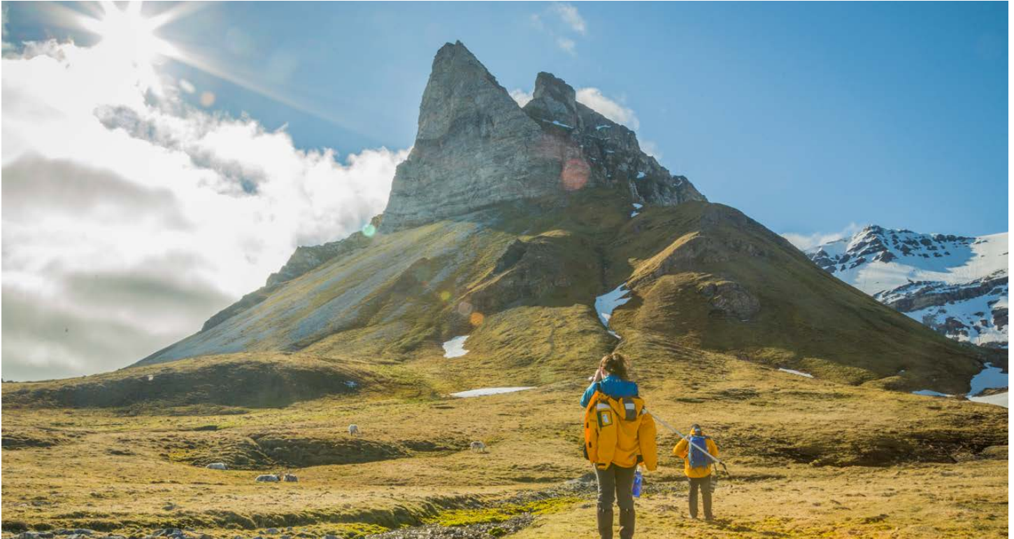
Photos captured with a telephoto lens from a responsible distance, following regulatory/AECO guidelines.