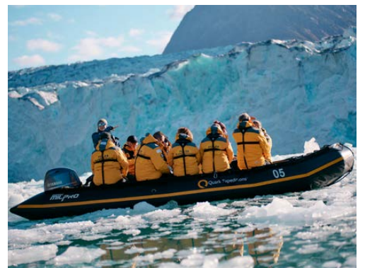
Photos captured with a telephoto lens from a responsible distance, following regulatory/AECO guidelines.