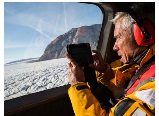
Photos captured with a telephoto lens from a responsible distance, following regulatory/AECO guidelines.