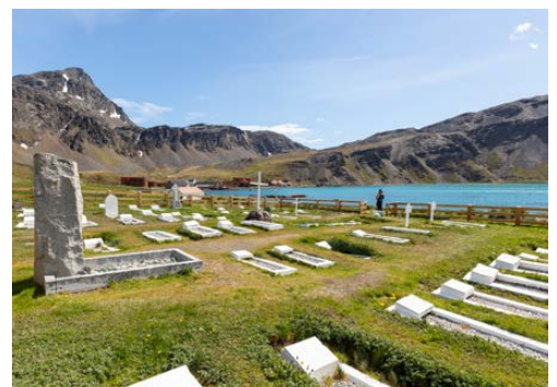
Photos captured with a telephoto lens from a responsible distance, following regulatory IAATO guidelines.