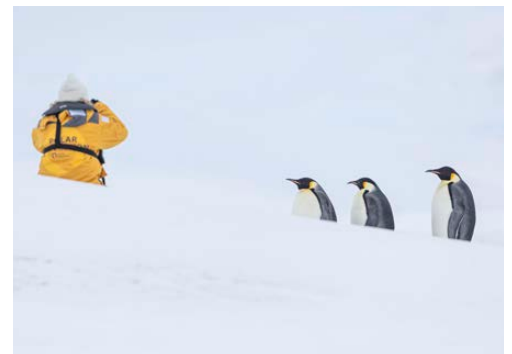
Photos captured with a telephoto lens from a responsible distance, following regulatory IAATO guidelines.