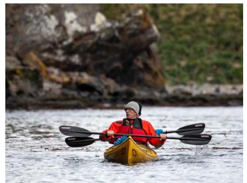
Photos captured with a telephoto lens from a responsible distance, following regulatory IAATO guidelines.