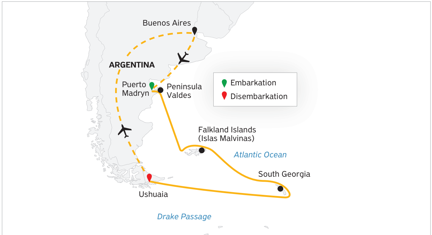
— Onboard Ultramarine - - - Flights to/from Buenos Aires