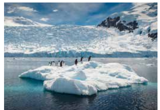
Photos captured with a telephoto lens from a responsible distance, following regulatory IAATO guidelines.