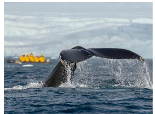
Photos captured with a telephoto lens from a responsible distance, following regulatory IAATO guidelines.