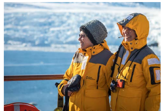
Photos captured with a telephoto lens from a responsible distance, following regulatory IAATO guidelines.