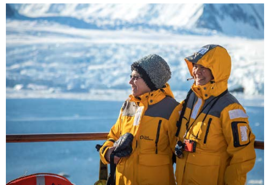
Photos captured with a telephoto lens from a responsible distance, following regulatory IAATO guidelines.