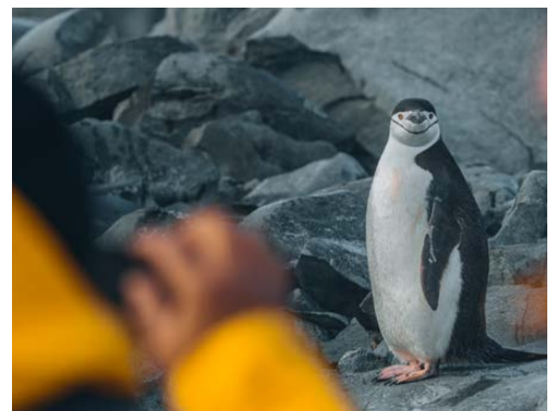
Photos captured with a telephoto lens from a responsible distance, following regulatory IAATO guidelines.