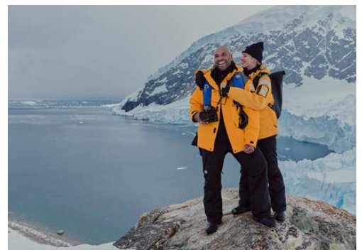
Photos captured with a telephoto lens from a responsible distance, following regulatory IAATO guidelines.