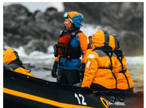
Photos captured with a telephoto lens from a responsible distance, following regulatory IAATO guidelines.