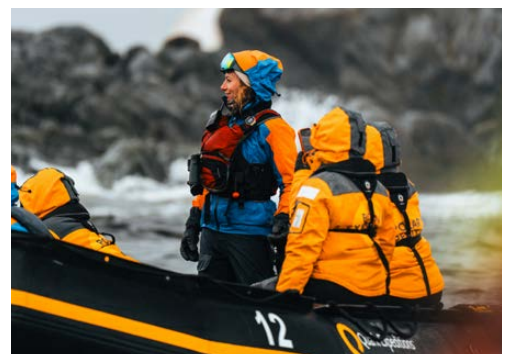
Photos captured with a telephoto lens from a responsible distance, following regulatory IAATO guidelines.