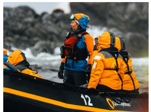
Photos captured with a telephoto lens from a responsible distance, following regulatory IAATO guidelines.