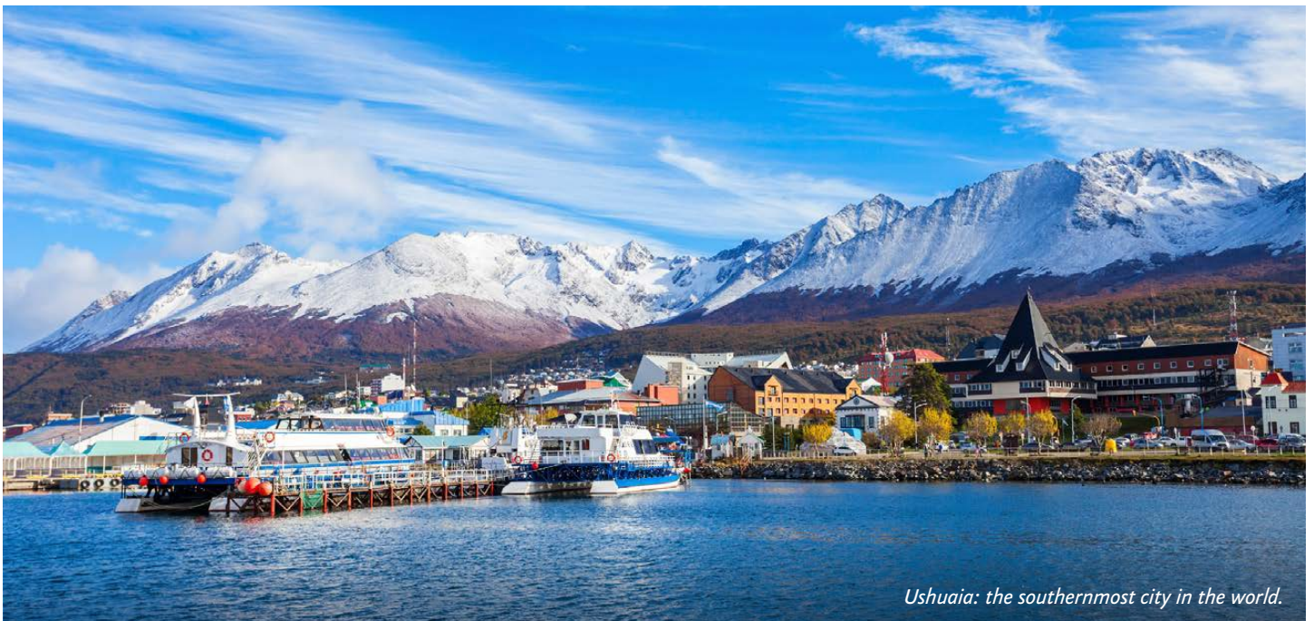
Ushuaia: the southernmost city in the world.

We request that you provide your flight details to Quark Expeditions at least 30 days prior to traveling.