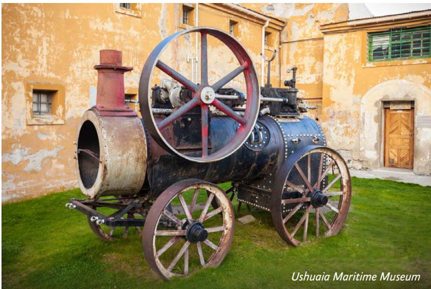
Ushuaia Maritime Museum