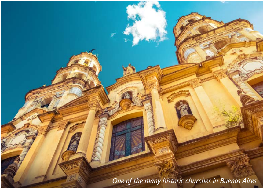
One of the many historic churches in Buenos Aires