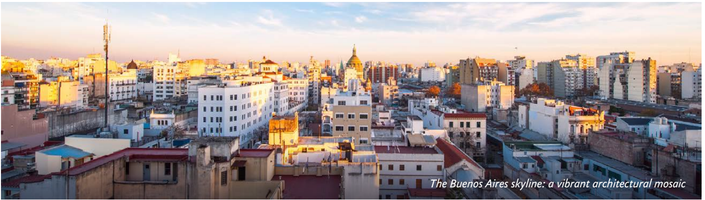
The Buenos Aires skyline: a vibrant architectural mosaic