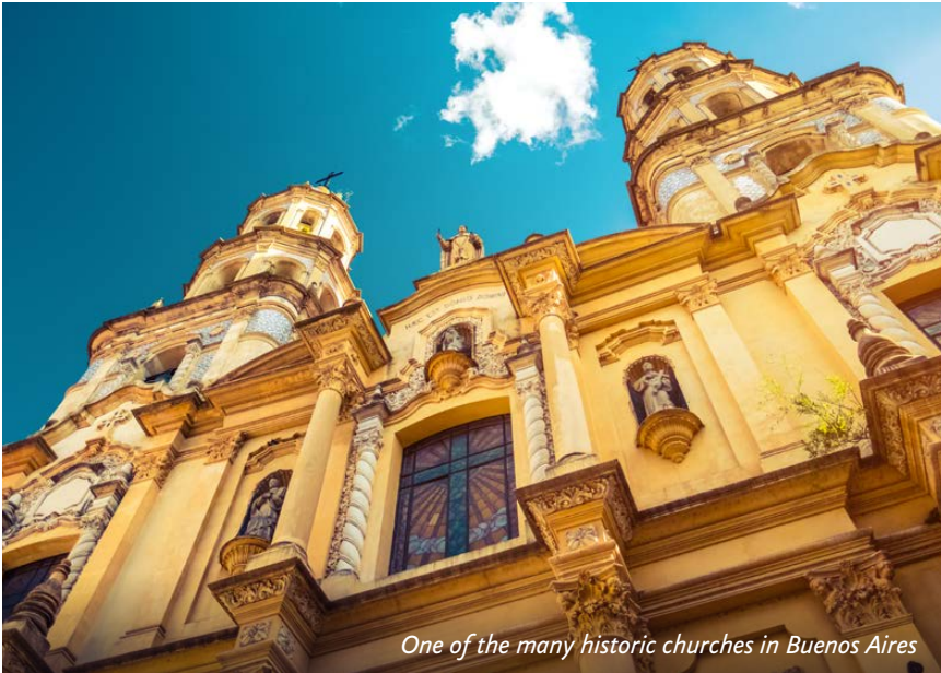
One of the many historic churches in Buenos Aires