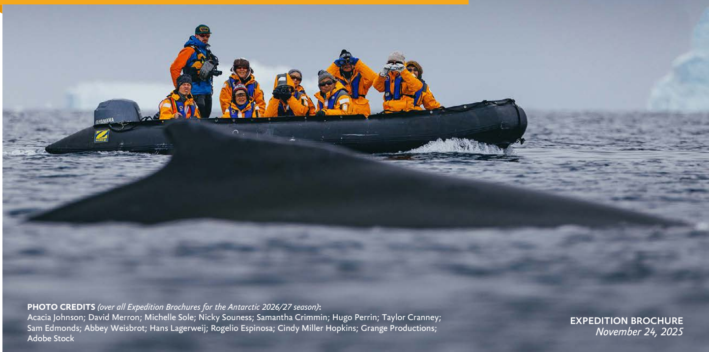
PHOTO CREDITS (over all Expedition Brochures for the Antarctic 2026/27 season):